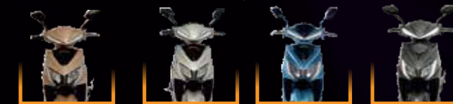
Golden Silver Sky Blue Grey