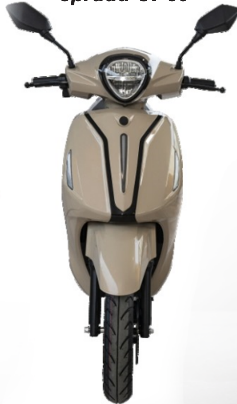
Sprada C1 60