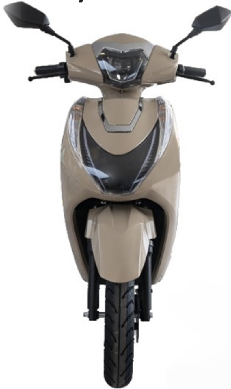
Sprada A2 72