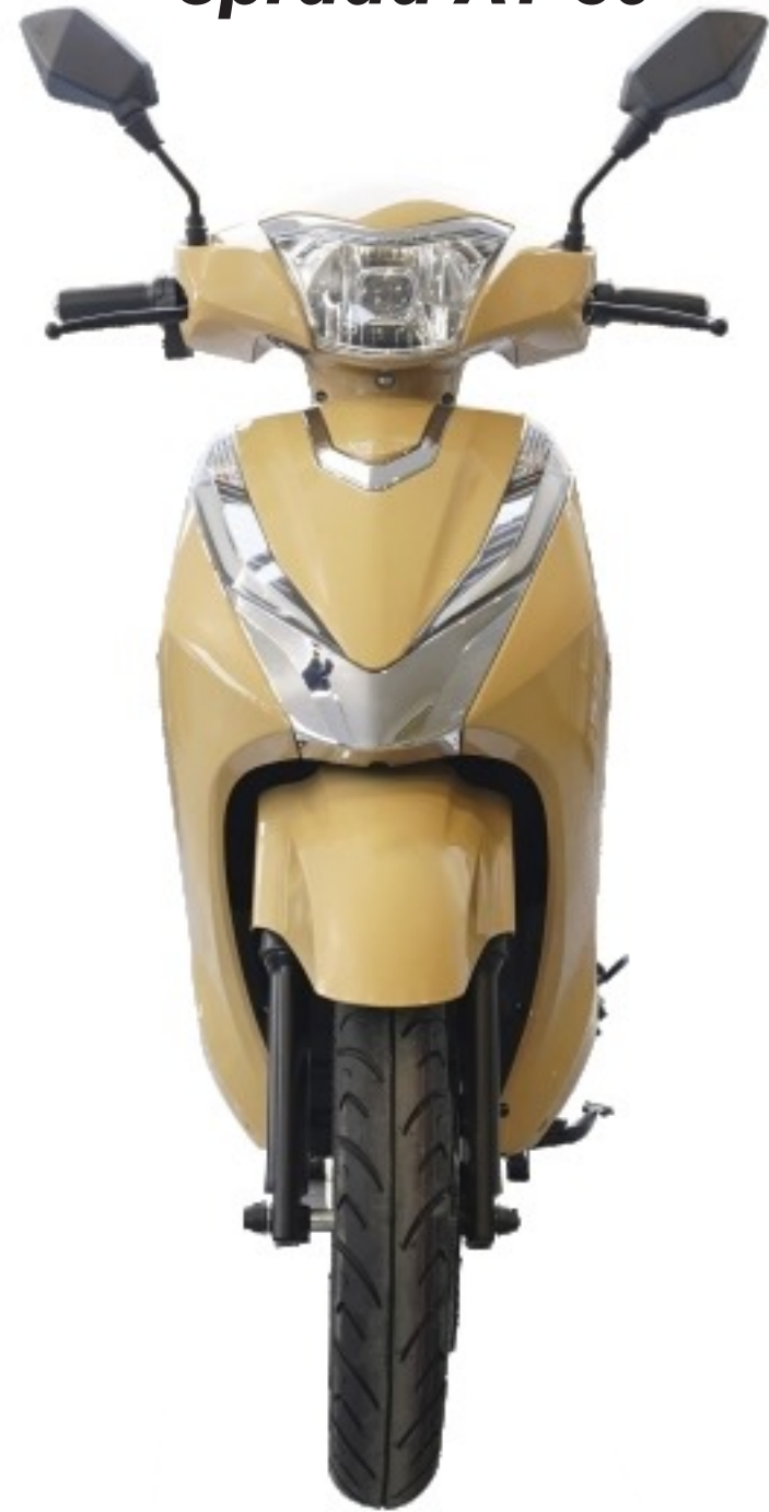
Sprada A1 60