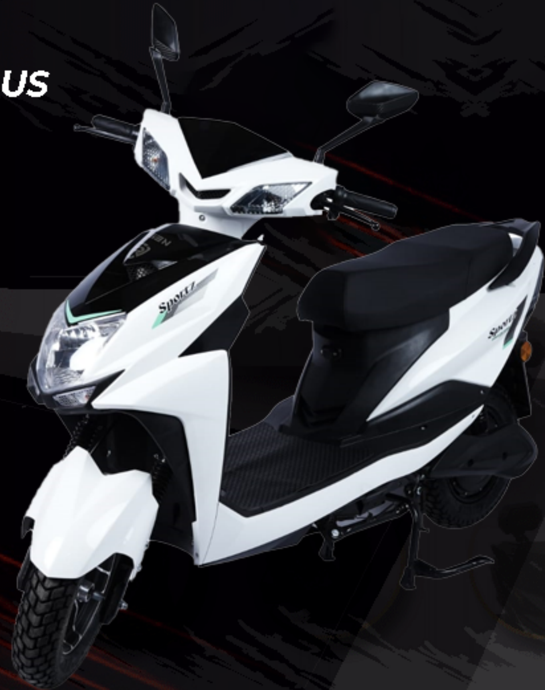
SPRADA SL1 48